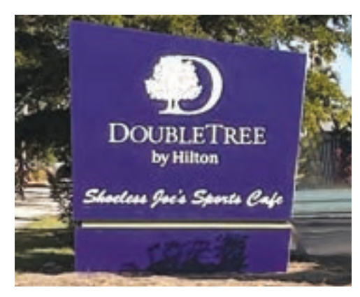
The newly installed sign at DoubleTree by Hilton Fort Myers also promotes the hotel's Shoeless Joe's Sports Café.